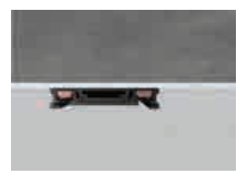
Calha Saliente REF. 31216 1000 mm REF. 31223 2000 mm