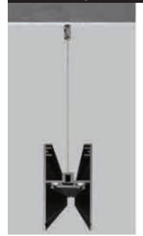
Calha Suspensa REF. 31339 1000 mm REF. 31346 2000 mm